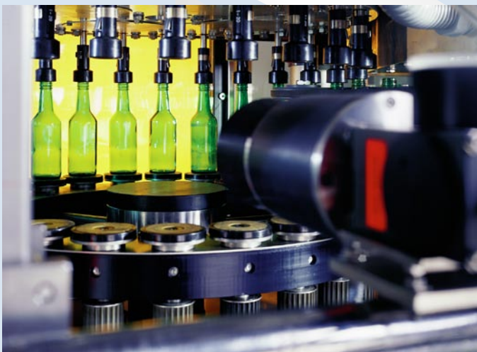
Figure 1 – Reliable performance. The image processing system based on Kontron custom CP306 CompactPCI® CPU boards is ideally suited for zero-failure tolerance filling lines with rugged, harsh environments.

Sophisticated image processing systems are becoming an increasingly indispensable part of quality control on automated filling and packaging lines that require zero failure tolerance. The embedded computer technology used in the systems needs to offer price-optimized, highly reliable real-time performance in a rugged environment. To meet these demands, one of the world's leading designers and suppliers of filling lines and control systems has developed a highly flexible image processing system based on custom-designed 3U CompactPCI® CPU boards from Kontron.