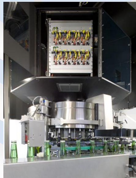
Figure 2 – The ‘blank slate’ principle provides exceptional application flexibility and easy integration. This picture shows a high end system with a total of 8 camera systems on two levels.

number of frame grabber cards and a customized Kontron CP306 CompactPCI® CPU board. After pre-processing the information from the cameras, the frame grabbers transmit the uncompressed image data, which could be a simple black & white bit map, a grey scale image or an RGB image depending upon the application, to the Kontron CP306 via the board's CPCI connectors. Image processing software written by Krones runs on the CP306 under Linux OS and determines, for example, whether a container is clean or contaminated or whether the fill level is within specified limits, depending on the designated task. The result (good or defect) is transmitted back to the frame grabber and forwarded via Ethernet to the central server which is responsible for high level control of the processing line.